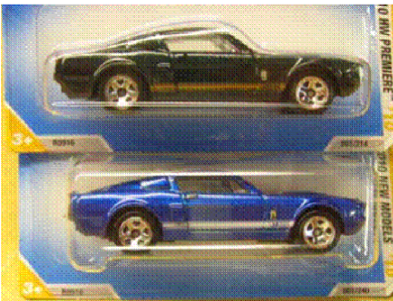
1967 G.T. 500 (Acapulco Blue & Dark Moss Green)