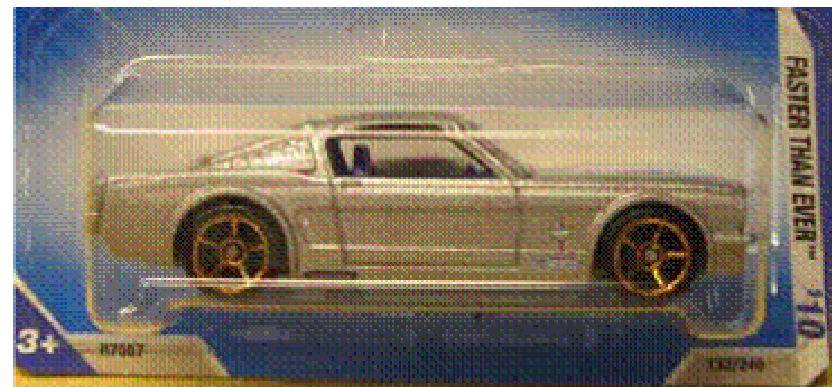
1965 Ford Mustang Fastback